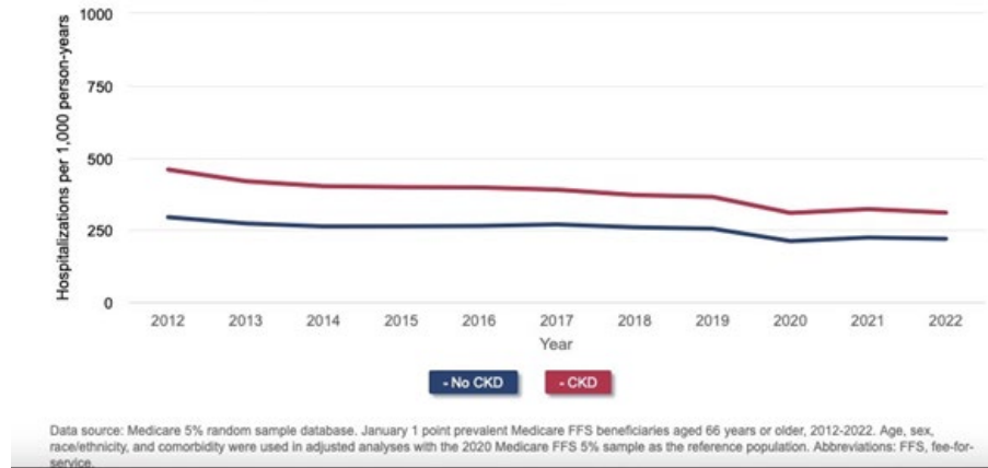
Figure 3. All-cause hospitalization rates in older adults, by presence of diabetes mellitus and cardiovascular disease, Medicare FFS, 2022, Adjusted by CKD Status 42